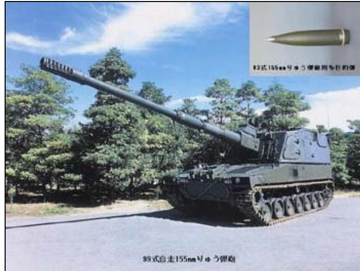
Type 99 155mm Self-Propelled Howitzer

To achieve such an autonomous capability, the Type 99 reportedly features an advanced computer-based navigation and fire control system, combined with an onboard ballistic computer. To date, the lack of available data has precluded a proper evaluation of the Type 99 fire control suite.