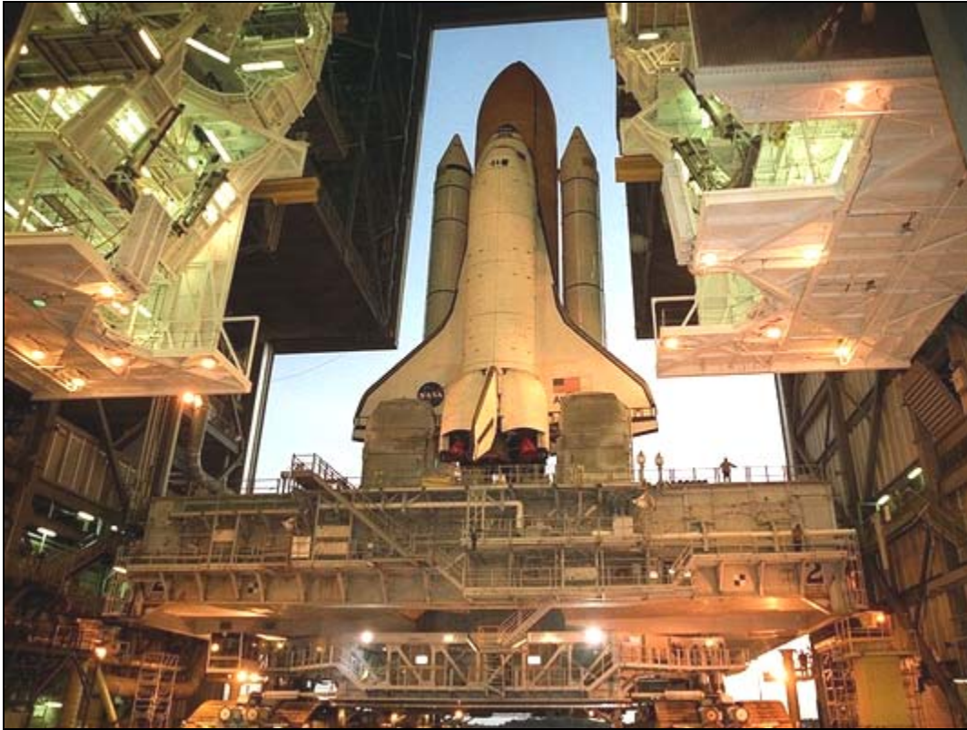
Space Shuttle Atlantis in the Vehicle Assembly Building