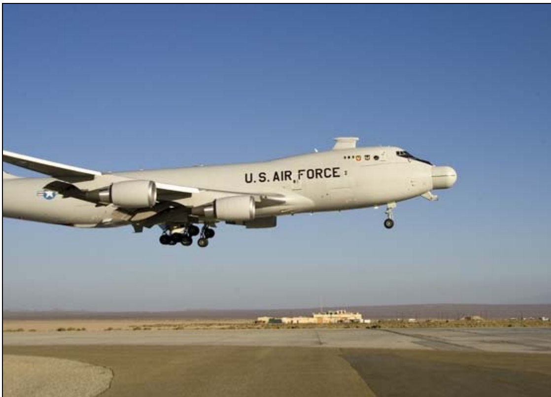
Airborne Laser Test Bed (ALTB)

Block 2010 addresses a broader range of threats and works toward integration with an overall BMDS. It focuses on the second ABL testbed, addressing performance enhancements and life-cycle cost considerations. It moves the program from design and development to acquisition and deployment.