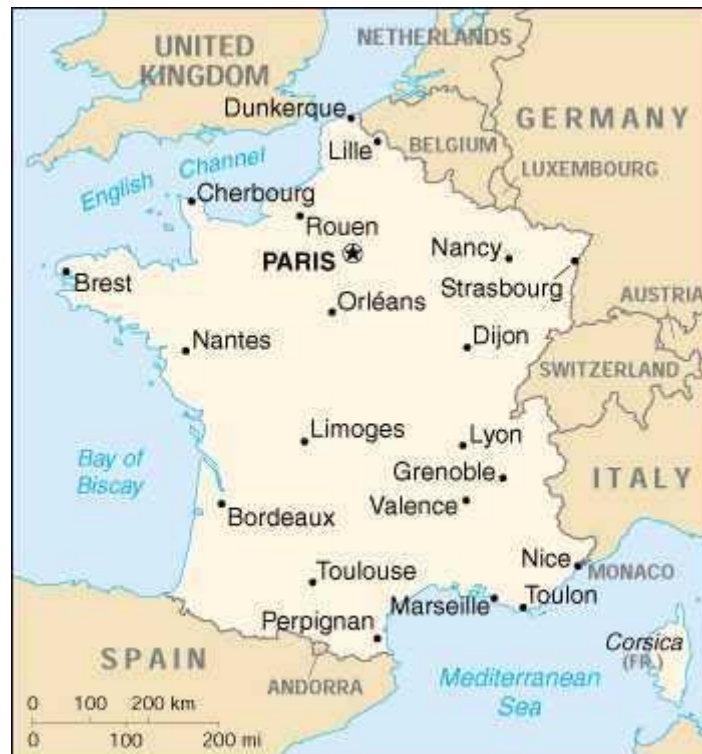
Sagem is developing the French Army Soldier System (FELIN).

Studies are already under way for what can provisionally be called Version 2. Version 2 is expected to be considerably more far-reaching than Version 1. Version 2 is tentatively scheduled to be completed by year-end 2015.