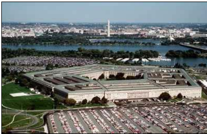
DMS is the messaging system of the U.S. DoD.

An FY12 DISA operation and maintenance budget document, dated February 2011, states that DISA's baseline review determined that the DMS infrastructure will be consolidated with other similar programs and products.