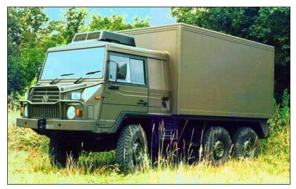
ASTOR Ground Segment Station