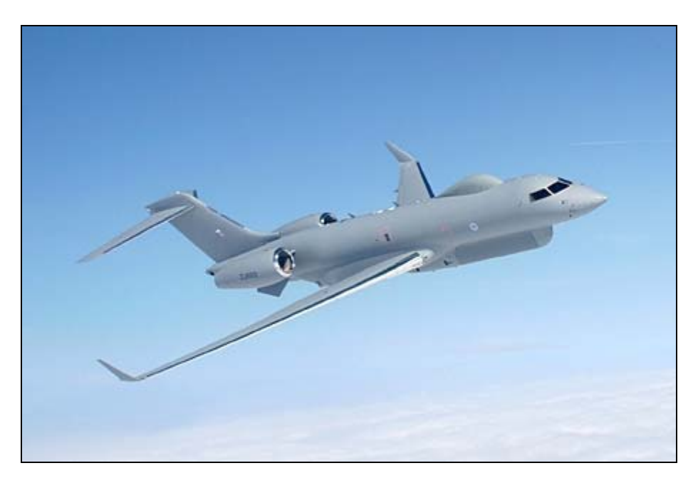
ASTOR in Flight