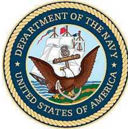
U.S. Navy Over-the-Horizon Targeting (OTH-T) Program

Coalition and joint interoperability is a key concern for future naval operations, especially given the Navy initiative to expand Internet Protocol (IP) networking throughout the U.S. Navy fleet. Currently, IP connectivity with Coalition forces is limited. Funding has been allocated for the development of solutions to IP connectivity issues in an effort to meet emerging Coalition and joint interoperability requirements.