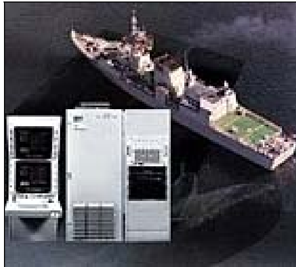
SQS-510 Medium Frequency Active/Passive Sonar

Performance of the system can be monitored under operational conditions, one option being to use Lockheed Martin Canada's performance figure measurement system for sonars.