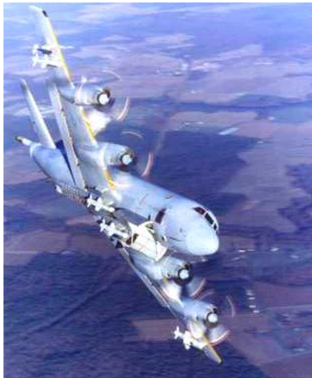
Lockheed-Martin P-3C Orion maritime patrol aircraft of US Navy is one of the primary platforms carrying the ASQ-81/ASQ-208 MAD system

Raytheon Systems produced four configurations of the ASQ-81(V). The ASQ-81(V)1, is mounted internally aboard land-based Lockheed P-3C aircraft. The unit is housed in a fixed tail boom that extends a short distance from the aircraft. The ASQ-81(V)3 is installed in the carrier-based Lockheed S-3A Viking, where it is extended on a boom, or sting. The ASQ-81(V)2 is a towed system used aboard the SH-2F/G and SH-3H. Another towed variant of this system, the ASQ-81(V)4, is used aboard the US Navy's Sikorsky SH-60B LAMPS Mk III helicopters. All versions of the ASQ-81(V) have the same C-6983 detecting set control, AM-4535 amplifier, and power control unit. The ASQ-81(V)1 and the ASQ-81(V)3 use a DT-323 magnetic detector, while the ASQ-81(V)2 and the ASQ-81(V)4 use a TB-633 magnetic detecting body. Both systems are self-compensating to correct for the magnetic properties of the ASW aircraft. The towed version is controlled by the C-6984 reel control, which works the RL-305 magnetic detector launching and reeling system.