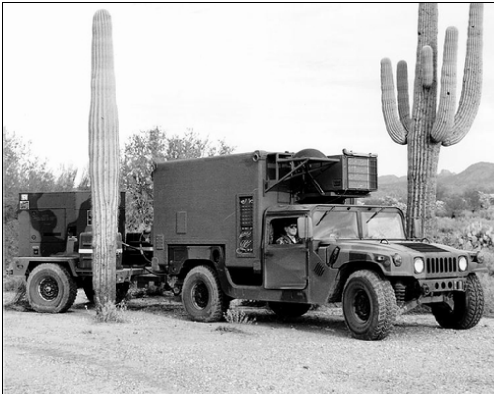
TSQ-179(V) Common Ground Station

JSTARS is truly a high-demand, low-density asset. From January to May 2003, nine JSTARS flew 193 mission sorties – 2,193 mission hours – in support of Operation Iraqi Freedom. This was the first time JSTARS was used as an Intelligence, Surveillance and Reconnaissance (ISR) asset as well as a Command and Control platform. Initially, there were problems at the Combined Air Operations Center (CAOC), until the operators got used to the intelligence generated by the E-8Cs. JSTARS was the key intelligence platform during the severe sandstorms in March 2003.