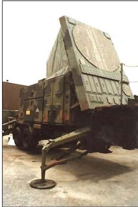
MPQ-53(V) Patriot Radar

missiles for reload. Battery fire units equipped with eight quad launchers can be deployed independently on M814 vehicles within one kilometer of the datalink and radar.