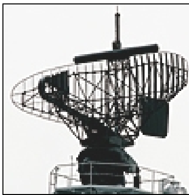
LW.08 (Jupiter) D-Band 2-D Naval Radar

RAWL-02 (PLN 517). This is an L-band variant produced by Bharat Electronics Ltd of India.