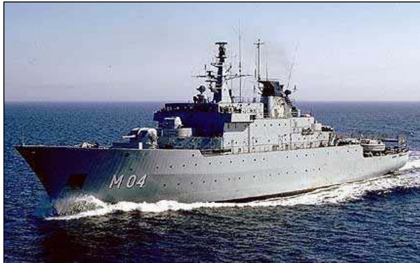
Swedish Minelayer Carlskrona

Threat data are transmitted to the ship's central data-handling system, giving the commander maximum time to initiate evasive maneuvers and defensive measures.