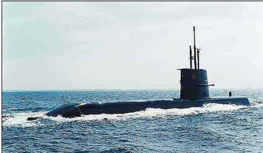
Gotland Class Submarine, Sweden

A unique feature of the Manta system is that its warning capability can be configured to predict the radar detectability of a submarine, depending on the frequency of the radar, the sea state, and the ESM mast/periscope configuration.