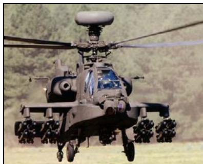
AH-64D Longbow Apache

The system increases the survivability and lethality of both helicopters, and supports selective Suppression of Enemy Air Defense (SEAD), armed reconnaissance, and attack missions. The system effectively extends the range of the radar and EO sensors, and can detect signals from hostile forces before those forces can detect the carrying helicopter.