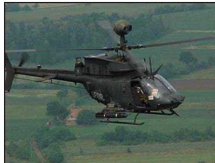
OH-58D Kiowa Warrior