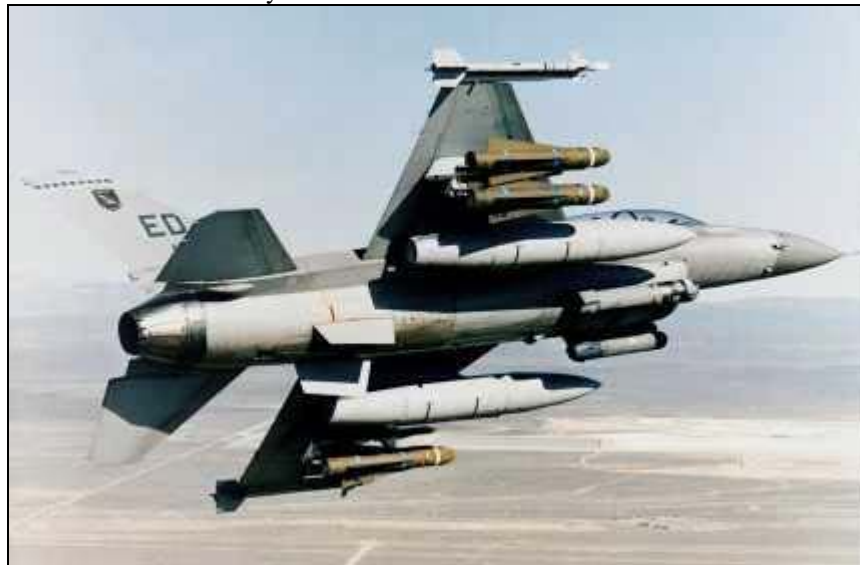
US Air Force F-16 Fighter

Sharpshooter provides precision standoff weapon delivery through the use of an 8-inch-aperture FLIR which has a narrow field of view (1.7°) and a wide field of view (6°). The stabilized line-of-sight includes 150° look-back angle and continuous roll tracker capabilities which can either track stationary or moving targets or track a scene using area correlation.