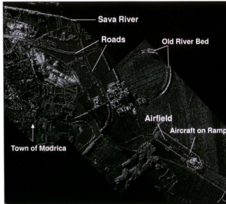
JSTARS SAR Display, Bosnia 1996