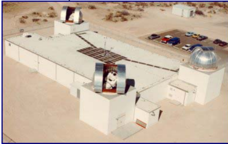
GEODSS site in Socorro, New Mexico

eye. The system operates only at night, and since it is an optical system, cloud cover and local weather conditions have a great deal of influence on its effectiveness.