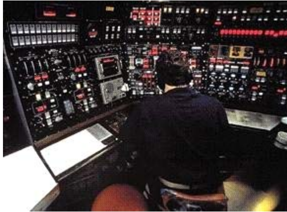
US Navy BSY-2 Advanced Combat System for Seawolf class submarines

detection to weapon launch. Among the characteristics of the BSY-2 that enhance Navy attack submarine capabilities are new acoustic arrays that have better detection performance and self-noise characteristics; a partitioned system architecture that facilitates tactical improvements, future growth, and high availability; computer aids to assist operators in sensor, contact, and weapon management; and finally, the employment of the most advanced submarine weapons.