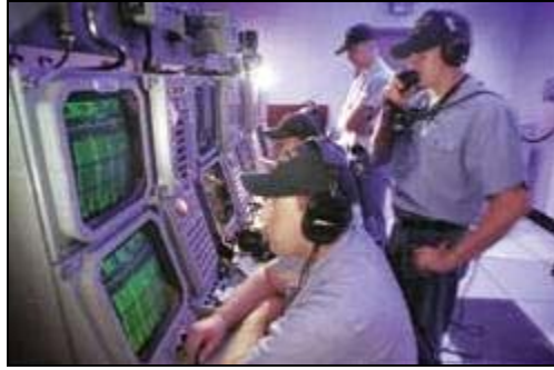
U.S. Navy BSY-1 Combat System training for Los Angeles class submarines