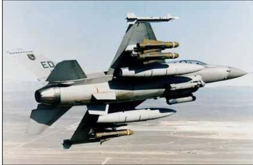
US Air Force F-16 Fighter