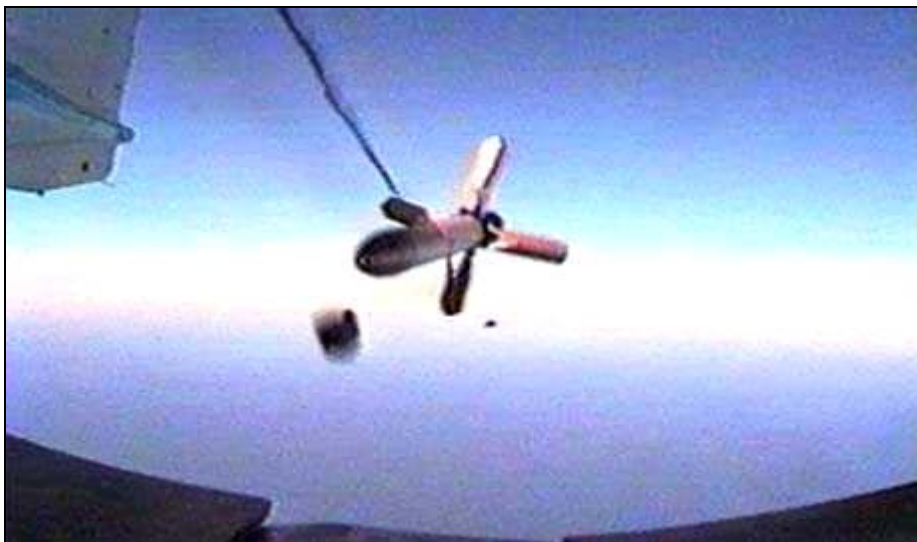
IDECM Towed Decoy

IDECM makes a missile approach warning system an integral part of the suite to detect IR/EO guided threats. This ensures that defensive countermeasures are coordinated, and overall protection is more efficient than if RF and IR/EO countermeasure systems are operated independently. It provides improved situational awareness for the aircrew and warns of the approach of non-radiating, heat-seeking missiles. The latter are proving to be the major threat facing tactical aircraft.