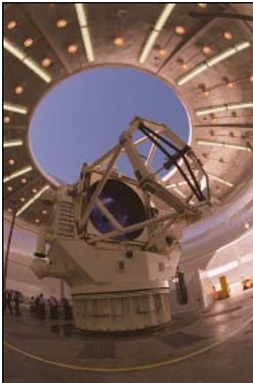
Advanced Electro-Optical System (AEOS)

Design Features. AEOS is a 3.67-meter electro-optical telescope upgrade to replace the existing 1.6-meter telescope at the Air Force Maui Optical Station (AMOS) on the island of Maui in Hawaii.