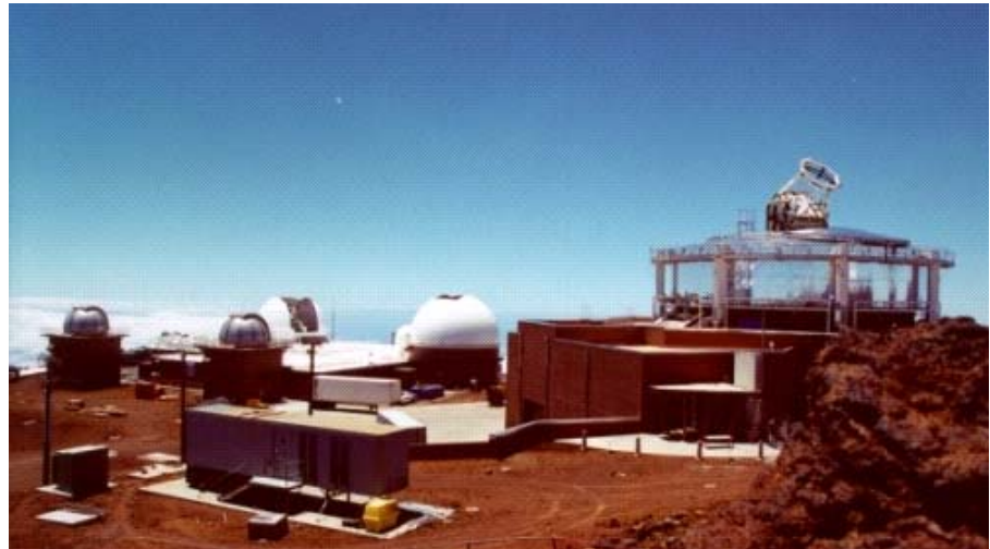
US Advanced Electro-Optical System (AEOS) Telescope Facility.