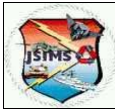
Joint Simulation System (JSIMS)

There are two key U.S. military training and coordination centers employing the JSIMS exercises. They are the Joint Warfighting Center at Fort Monroe in Virginia, which supports all unified commands, and the U.S. Atlantic Command's Joint Training Analysis and Simulation Center in Suffolk, Virginia, which supports all U.S.-based combat forces. The Army's module is known as the Warfighter's Simulation 2000 (WARSIM 2000). The Air Force's module is known as the National Air-Space Module (NASM). The Navy's module is called the Maritime Simulation Model (MARISM).