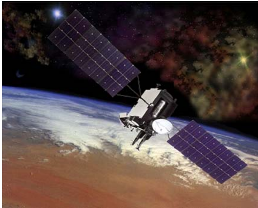
Lockheed Martin Space System's AEHF Satellite