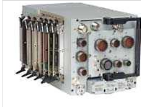
Link 16 MIDS Tactical Data Link Terminal Made by ViaSat

applications, air surveillance is increased between aircraft and air defense ships as well as surface and anti-submarine warfare operations. Armies stand to benefit from increased battlefield air management, as MIDS boosts the interoperability of weapons and networks on the battlefield.