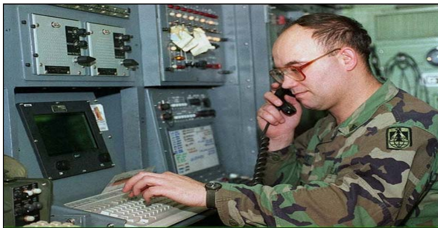
Interior view of a TTC-39

Interfaces. The TTC-39(V) interfaces with the US AUTOVON and AUTODIN networks, with NATO communications systems, and with a wide variety of current and planned TRI-TAC subscribers, switches, COMSEC, transmission systems, and technical control elements.