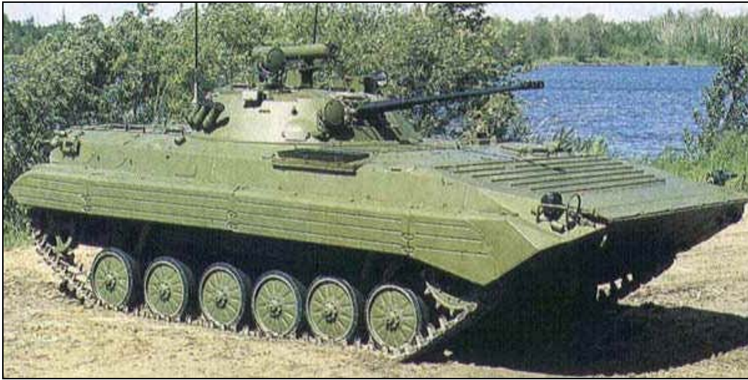
BMP-2 Mechanized Infantry Combat Vehicle