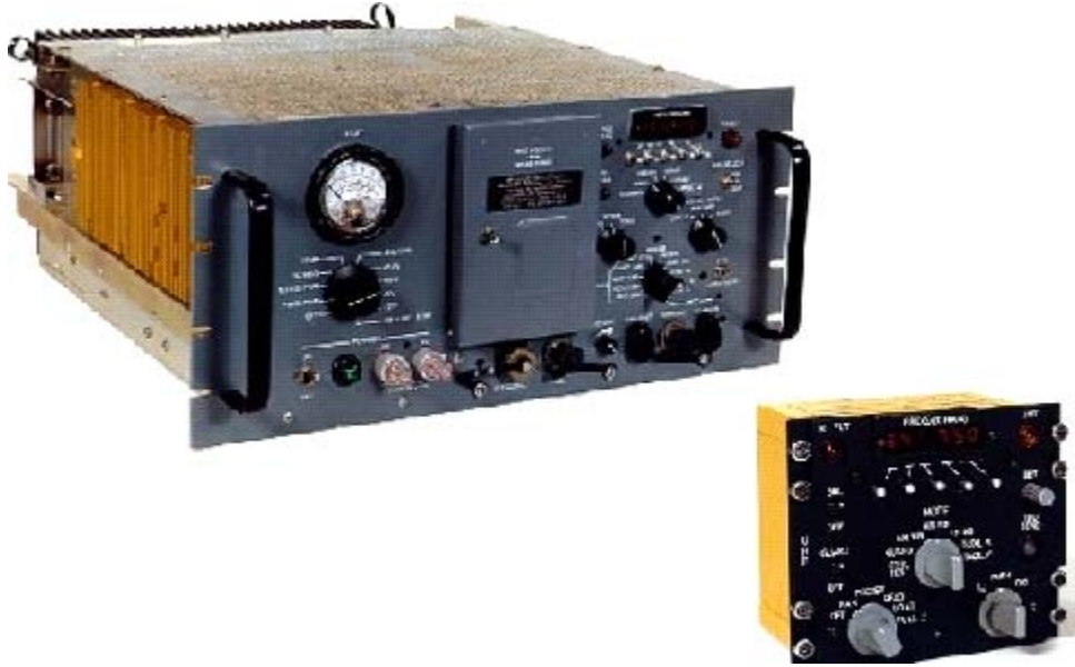
Rockwell Collins GRC-171

sites. The models within this variant feature Built-In Test capability in the receiver-transmitter. They also feature 99 presets. The Air Force contracted with Rockwell Collins to develop a modification kit for the GRC-171(V)4 radio to incorporate Have Quick compatibility.