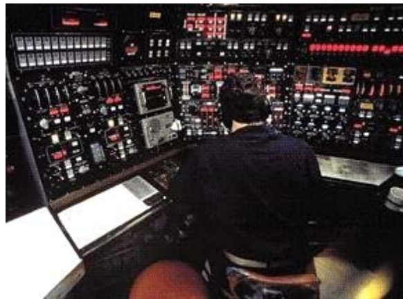
US Navy BSY-2 Advanced Combat System for Seawolf class submarines

Operational Characteristics. The development requirements for the BSY-2 included the following: develop an architecture that facilitates tactical enhancements and future growth, and provide computer processes that improve response time from initial threat detection to weapon launch. Among the characteristics of the BSY-2 that enhance Navy attack submarine capabilities are new acoustic arrays that have better detection performance and self-noise characteristics; a partitioned system architecture that facilitates tactical improvements, future growth, and high availability; computer aids to assist operators in sensor, contact, and weapon management; and finally, the employment of the most advanced submarine weapons.