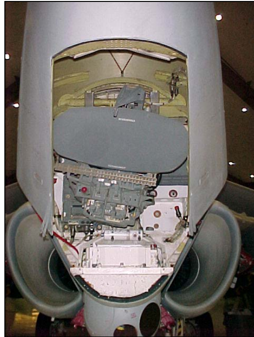
Original A-6 Antenna

theater of operations. The capabilities and characteristics of the two aircraft are complementary.