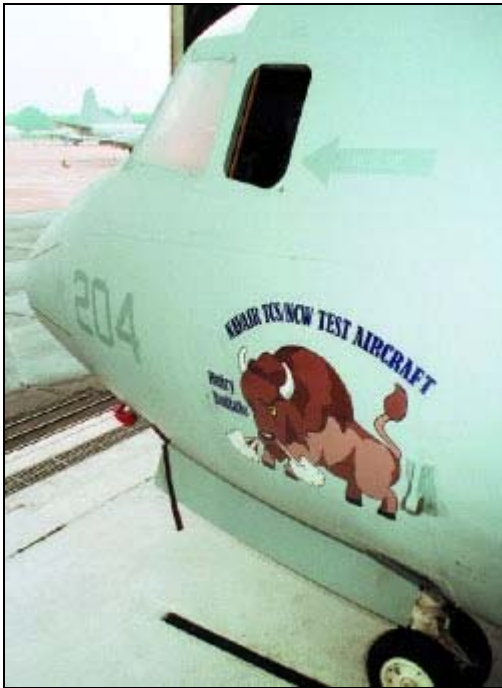
The Hairy Buffalo's colored breath represents the multi-spectral sensor package used in Fleet Battle Experiments

surveillance, with the APY-6(V) covering the land battlefield. Operationally, a JSTARS/APY-6(V) combination could support operations through an entire