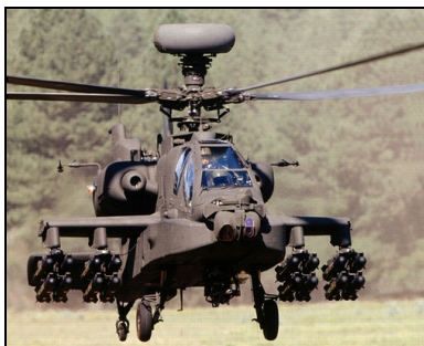
AH-64D Longbow Apache

The system increases the survivability and lethality of both helicopters, and supports selective Suppression of Enemy Air Defense (SEAD), armed reconnaissance, and attack missions. The system effectively extends the range of the radar and EO sensors, and can detect signals from hostile forces before those forces can detect the carrying helicopter.