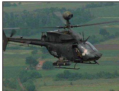
OH-58D Kiowa Warrior