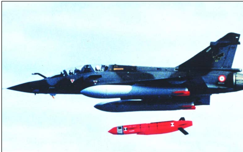
Release of APACHE