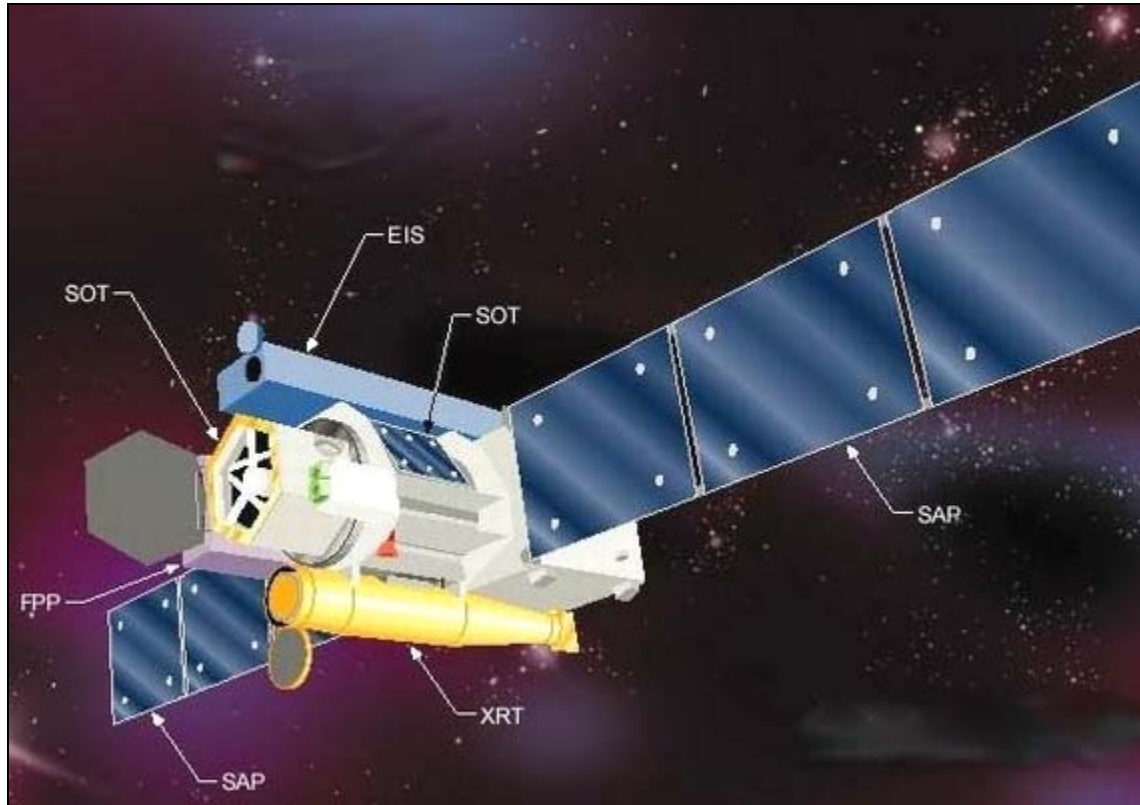
Artist's Impression of Solar-B and Instrumentation

Contractors are invited to submit updated information to Editor, International Contractors, Forecast International, 22 Commerce Road, Newtown, CT 06470, USA; rich.pettibone@forecast1.com