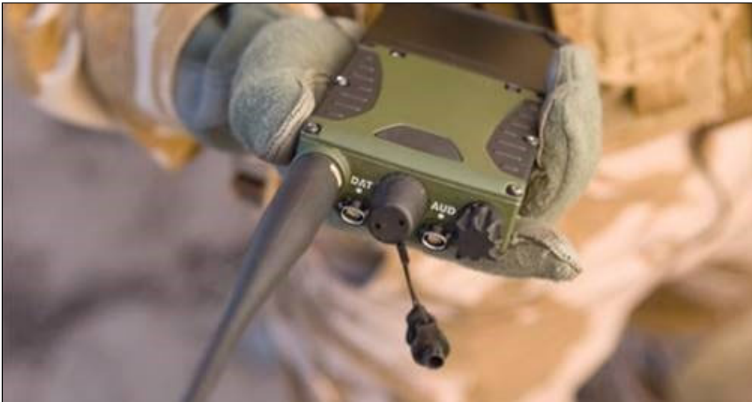
The L3Harris RF-7800S