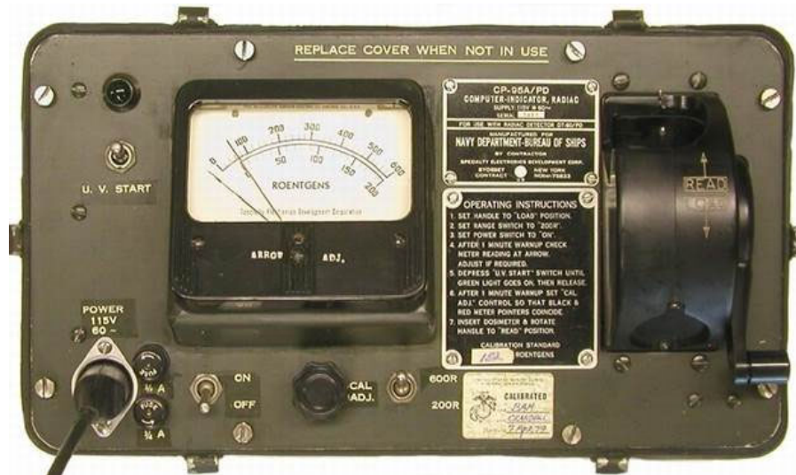
RADIAC CP-95A/PD DT-60 Reader