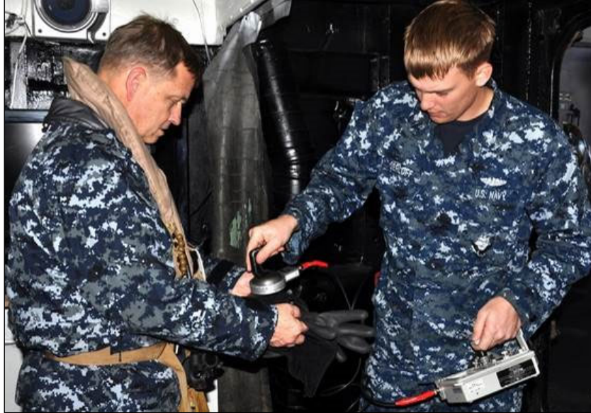
U.S. Radiological Control Monitoring