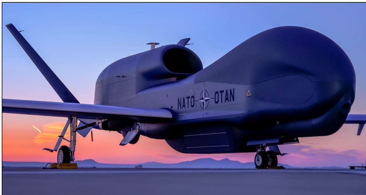
The Global Hawk Block 40-based NATO AGS UAV features the ZPY-2 MP-RTIP.