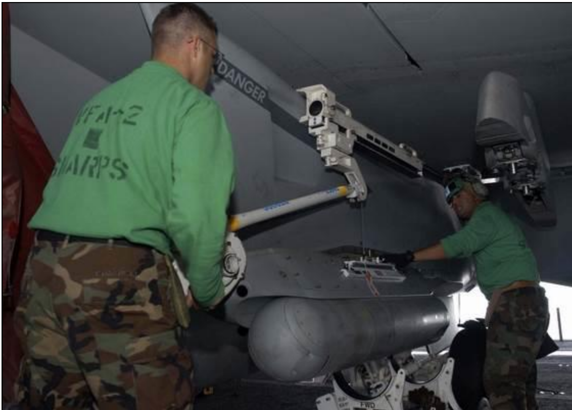
Raytheon's ASQ-228 ATFLIR Being Installed on an F/A-18 Super Hornet

The ATFLIR system's mean time between failures (MTBF) exceeds 600 hours.