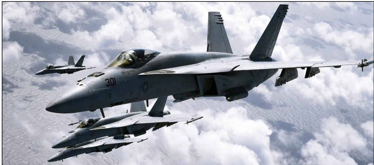
ATFLIR flies on board U.S. Navy F/A-18Es (mounted on lower outside corner of left air intake).