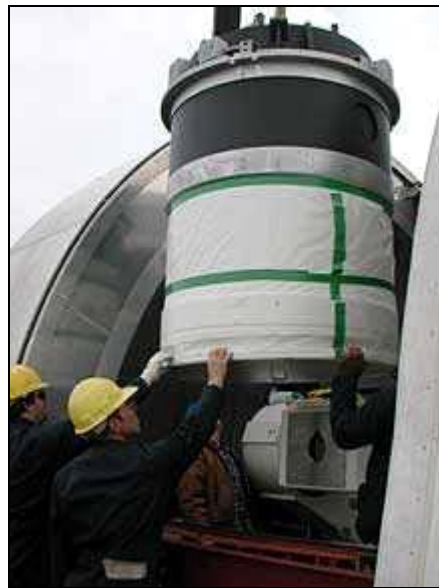
U.S. Air Force/NASA Maui Space Surveillance Telescope

exposure time and quick electronics, the camera is able to achieve wide-sky coverage and detect objects much fainter than is possible using the original photographic Schmidt telescope at Palomar Observatory in Southern California, as was done in the past.