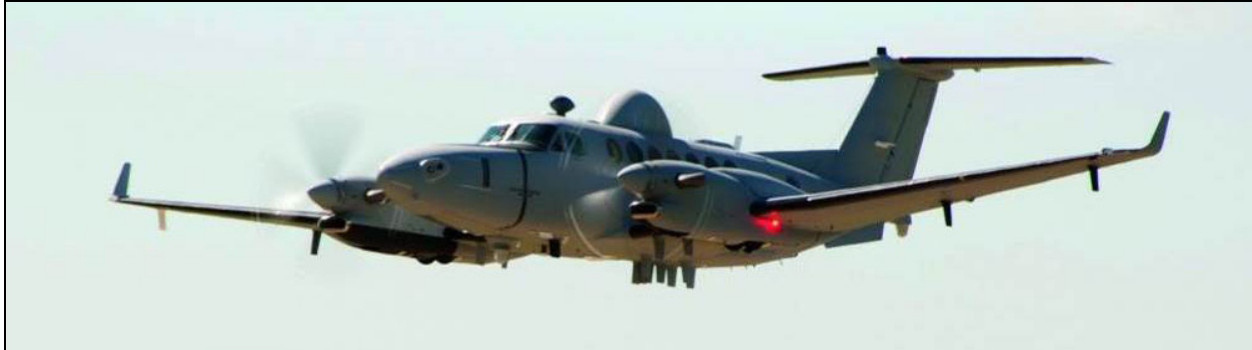
King Air 350-Based EMARSS-S in Flight

Note: The information in Technical Data , above, specifically refers to the EMARSS-S variant. Information on other variants can be found in the Variants/Upgrades section.