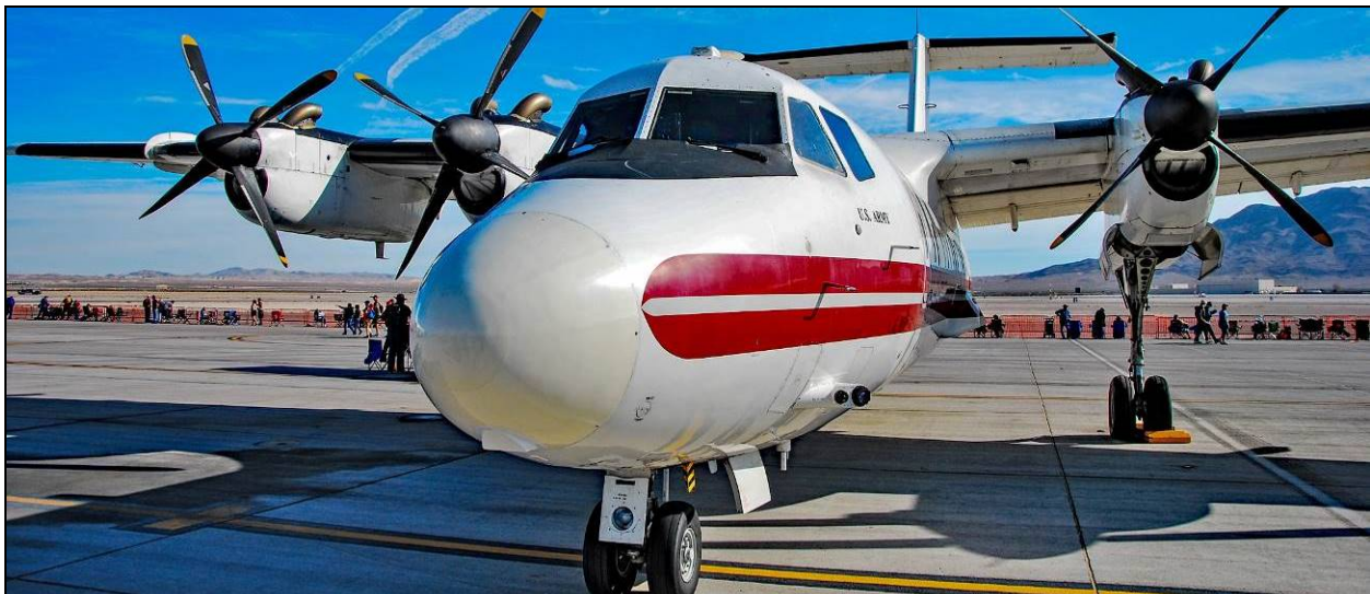
An EO-5C ARL-M Based on the De Havilland Dash 7

Finally, the budget included funding for modification of the existing HD sensors. This modification would result in the provision of HD EO/IR sensors on the ARL aircraft that supported OIF. Due to the high operational tempo of OIF, the existing imagery intelligence sensors burned out and required immediate replacement.