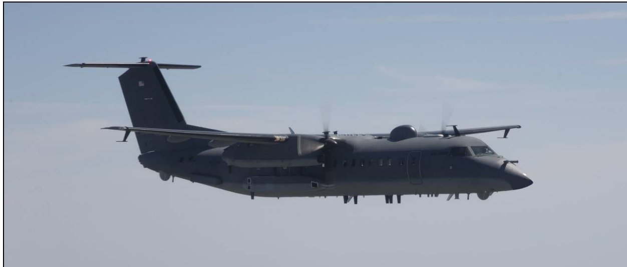
The RO-6A ARL-E is based on the Bombardier Dash 8 Q300 platform.

The ARL-M is an X-band reconnaissance and surveillance system that has two modes of operation. Its WAMTI mode scans a 10,000-square-kilometer area in less than a minute, detecting ground movers that are depicted on a cartographic map of the area. The depicted symbols provide target direction and location information. The SAR spot mode provides 1.8-meter-resolution imagery of a 10-square-kilometer area. The WAMTI mode detects movement on the ground and provides a cue to invoke the spot mode for an SAR image of the same area.