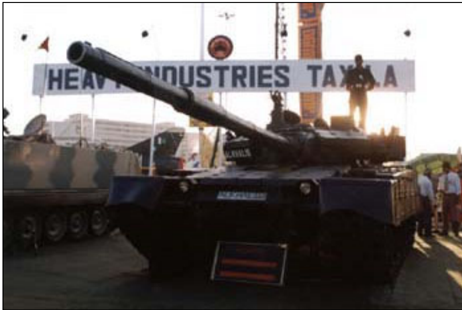
Al-Khalid Main Battle Tank

The system comes in two versions: cooled and uncooled. The uncooled model features a 256 x 128 pixel uncooled detector operating in the 8- to 14-micron band. Two fields of view (FOV) are provided to the gunner. The cooled version also provides two FOVs and features an eight-element SPRITE detector operating in the 7.5- to 11.5-micron band.