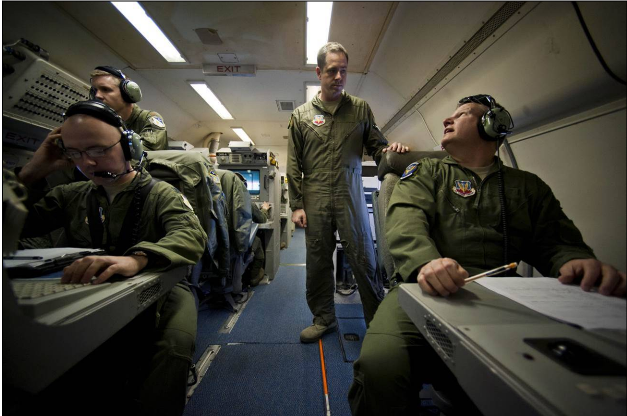
Crewmen at the Controls of a U.S. Air Force E-8C Joint STARS