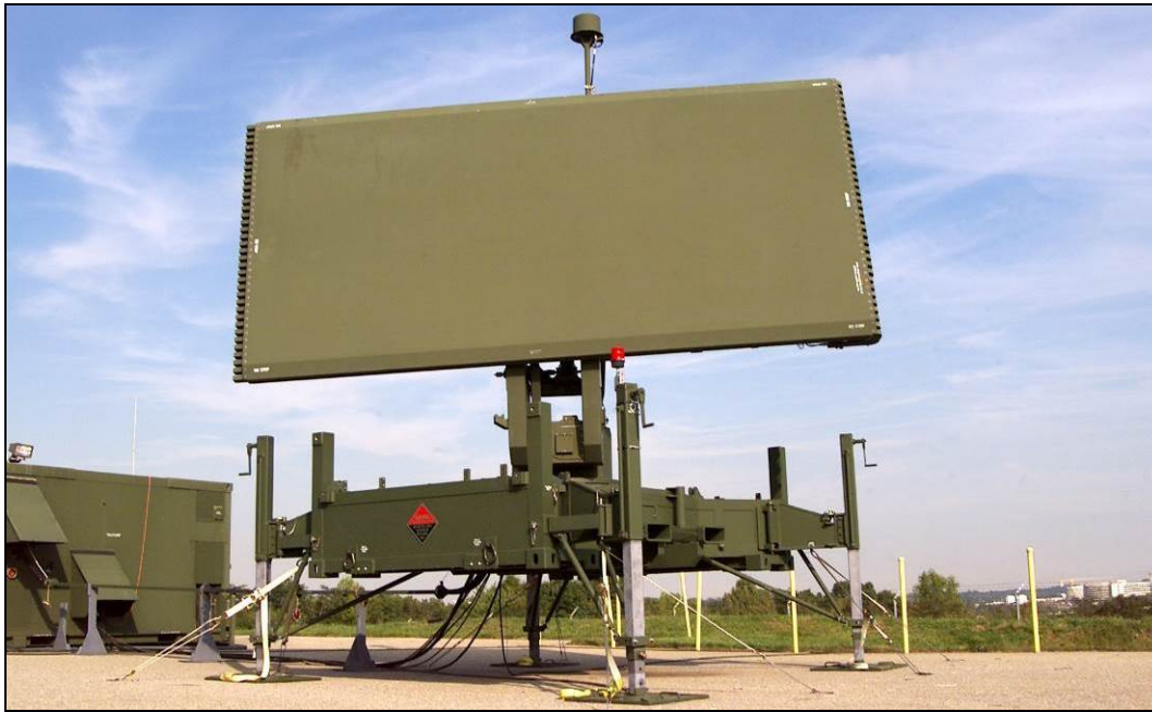
A TPS-78 antenna is deployed on its pallet, with shelter visible in the background.

The system's ISO-compliant 14-foot (4.3-m) shelter / pallet is transportable by a single C-130 aircraft. Once the radar is onsite, the TPS-78 can be set up for operation by four people in approximately 30 minutes. The operators then obtain the radar's data through liquid crystal or flat-panel displays, or via remote control.