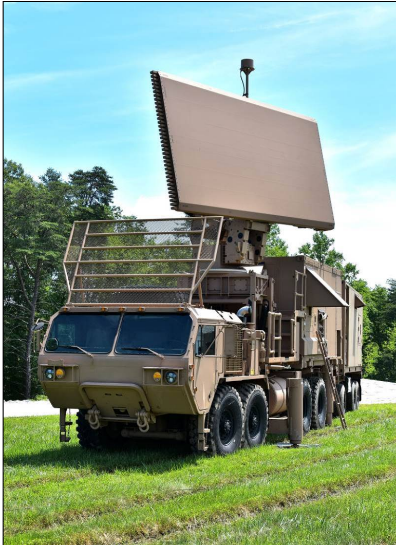
Truck-Mounted TPS-78 Radar