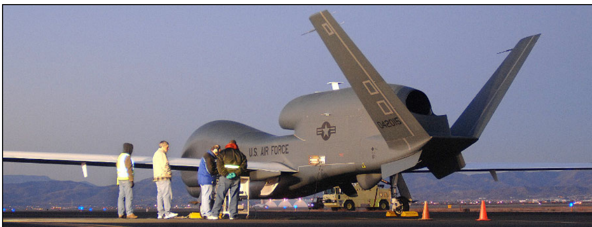
RQ-4 Block 20 Global Hawk, the EISS's First Platform

Global Hawks were rushed to support the war in Iraq, performing high-altitude loitering surveillance for ground commanders. Global Hawk was one of 10 different UAVs deployed to the combat arena.