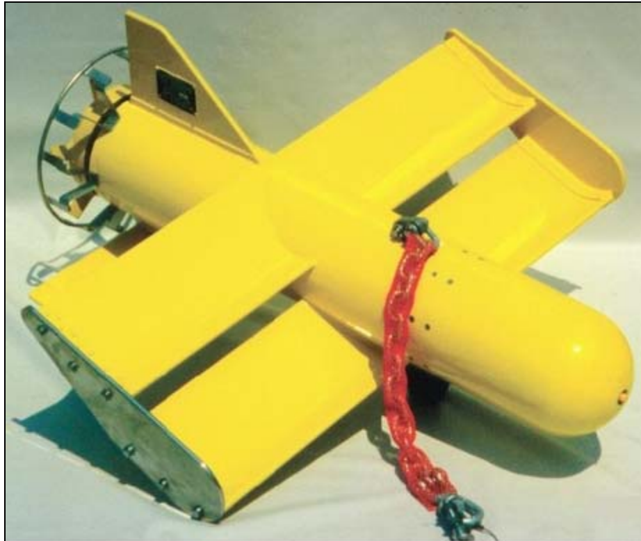
A/N37U-1 Mine Clearing System (MCS)