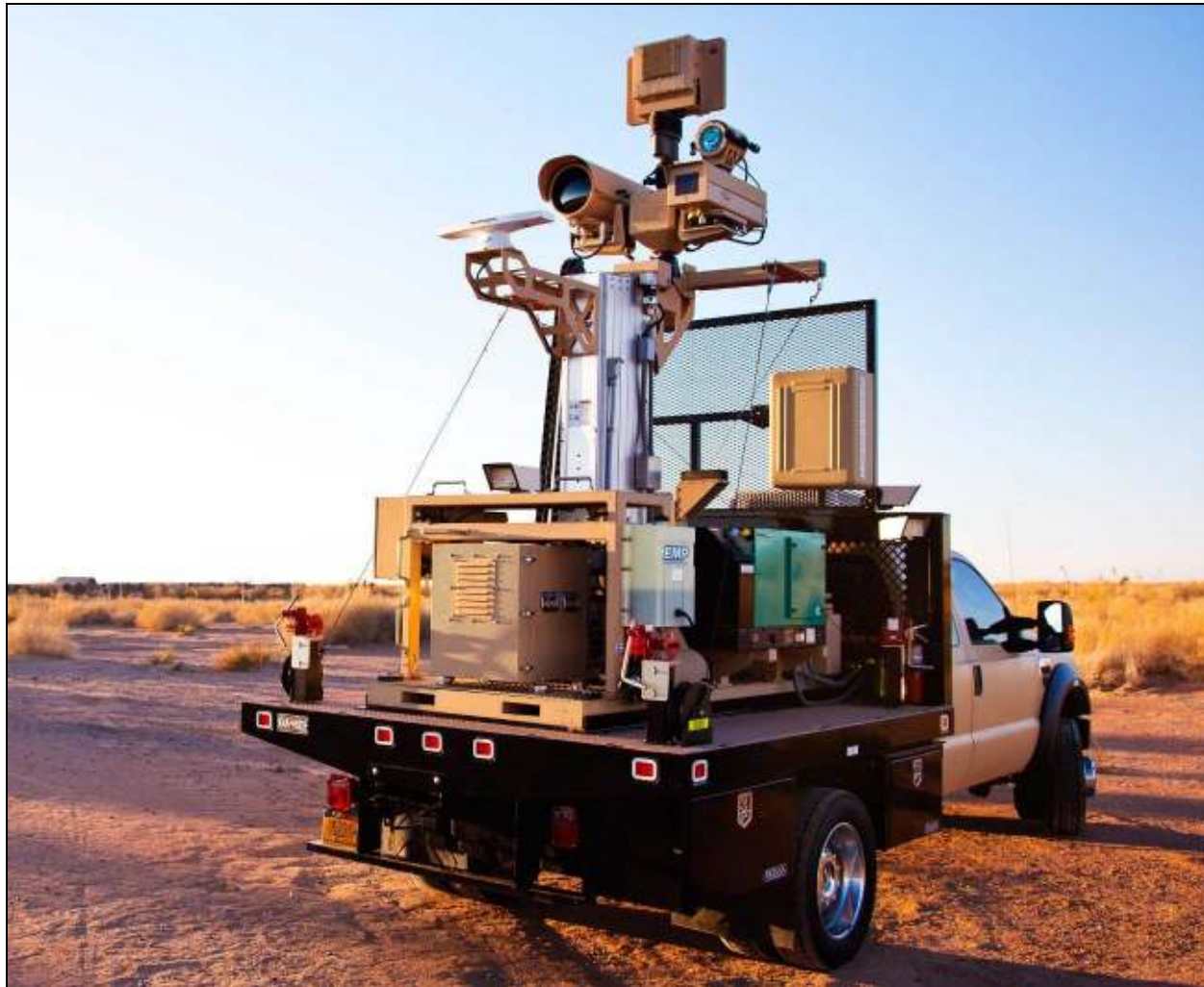
The ARSS-Equipped RaVEN-M Border Patrol Vehicle