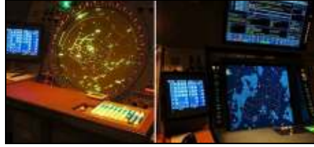
Old Terminal on Left; New STARS on Right