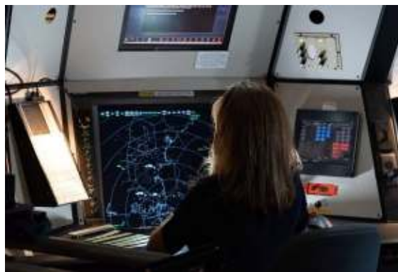
Standard Terminal Automation Replacement System (STARS)

Raytheon also manufactures a military version of the STARS that is known as the DoD Advanced Automation System (DAAS).