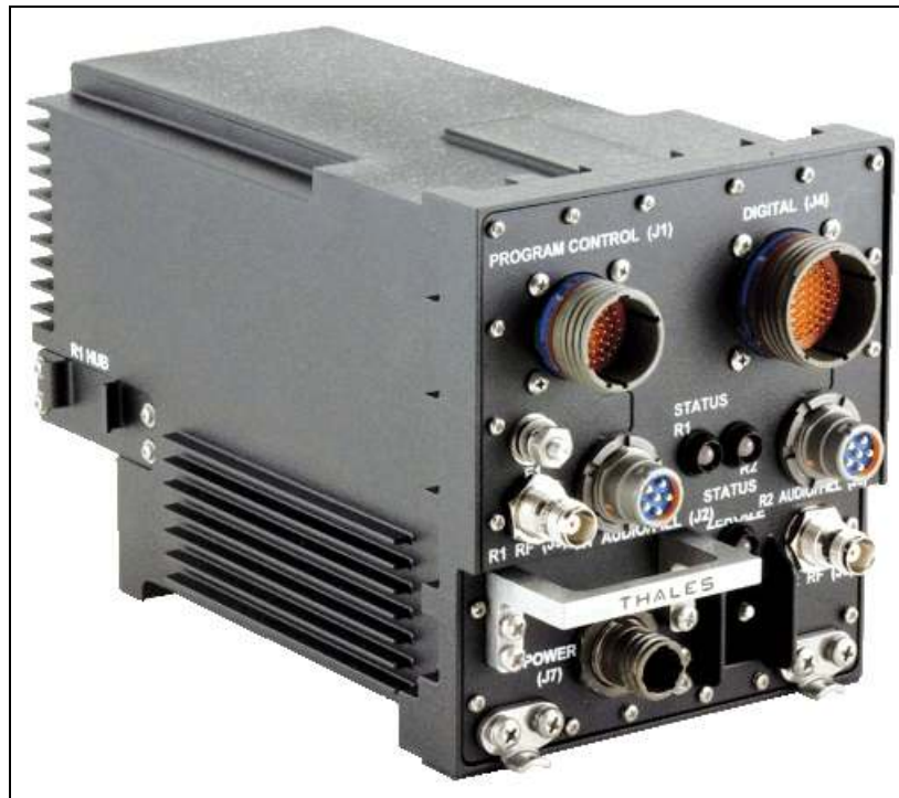
The Multichannel, Multiband Airborne Radio (MMAR) / ARC-6999

The company says the tough design of the MMAR meets the environmental extremes of unmanned aircraft system (UAS) platforms. The company also says the MMAR retains a small size and low weight and power, providing excellent support to a range of operations that include aerostat, high-altitude long-endurance (HALE), extended-range/multipurpose (ER/MP), and other tactical unmanned airborne missions.