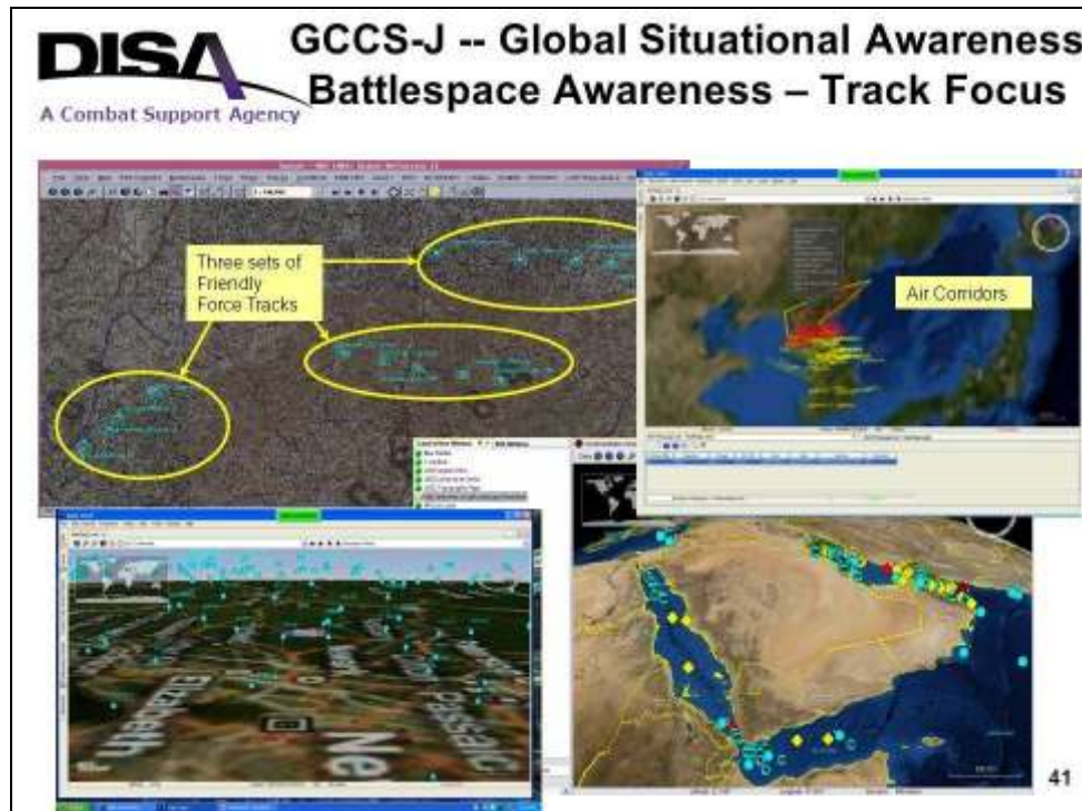
Developing Comprehensive Net-Centric Operations and Predictive Capabilities